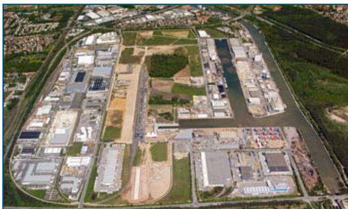
A Bavarian commercial property as seen from the air